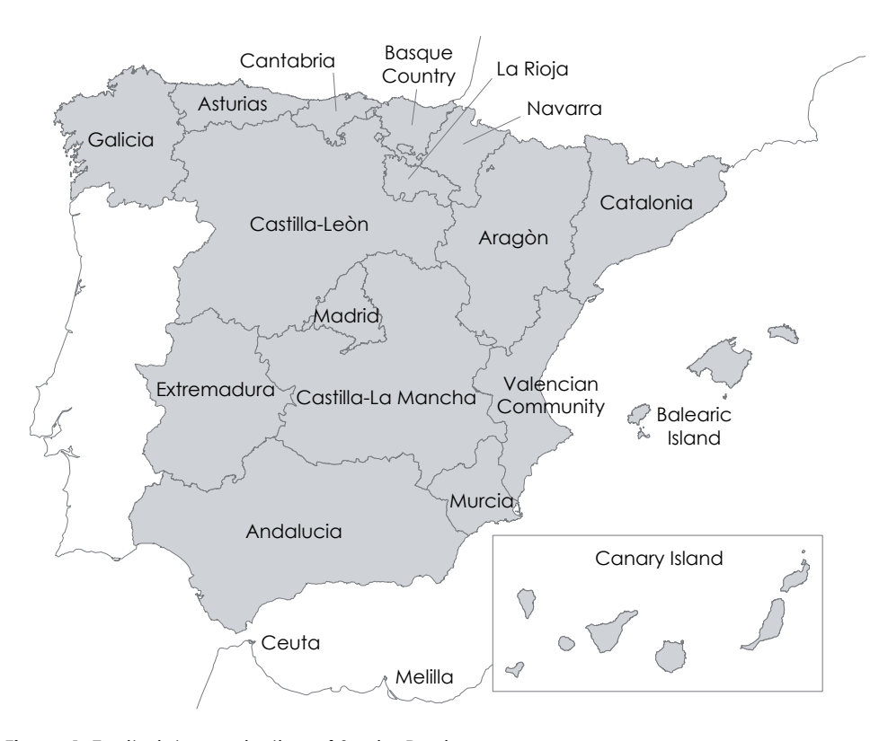
Figure 1. Territorial organization of Spain: Regions